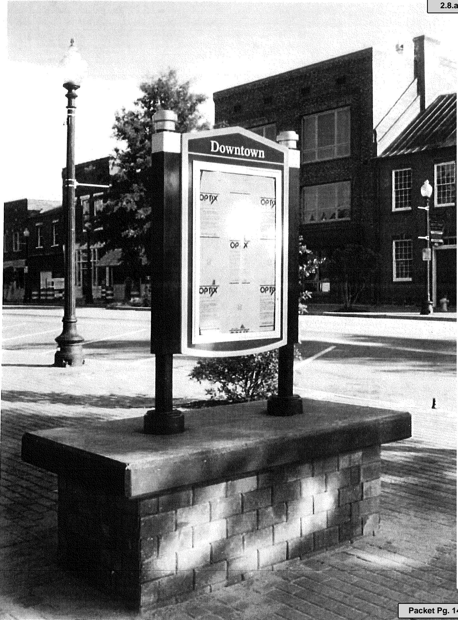
Attachment: 2-25-16 Ozark Kiosk on Square (2811 : Square Beautification)